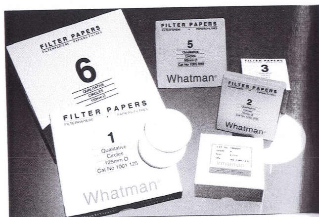
Selection – Cellulose Filters: Trace Elements – Typical Values ( \mu\text{g/g} Paper)

The different groups of cellulose filters offer increasing degrees of purity, hardness, and chemical resistance.